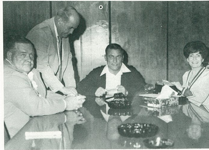
Before getting down to the nitty gritty.