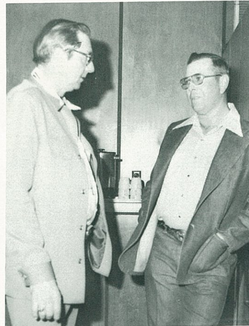
Why don't we tear it down and start over?